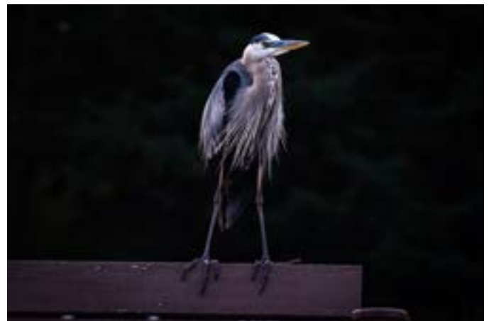
"Why Fly When You Can Stand"

Thank you for your support! Together, we ensure Little Sand Lake remains healthy, protected, and thriving for generations to come.