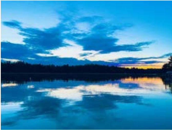
"Magic Sunset of Little Sand" Photo by Matt Janke- 2024 Photo Contest Winner 18 and Under Category.