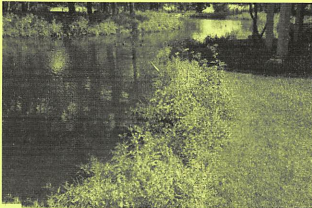
Lakeshore Seed Packet