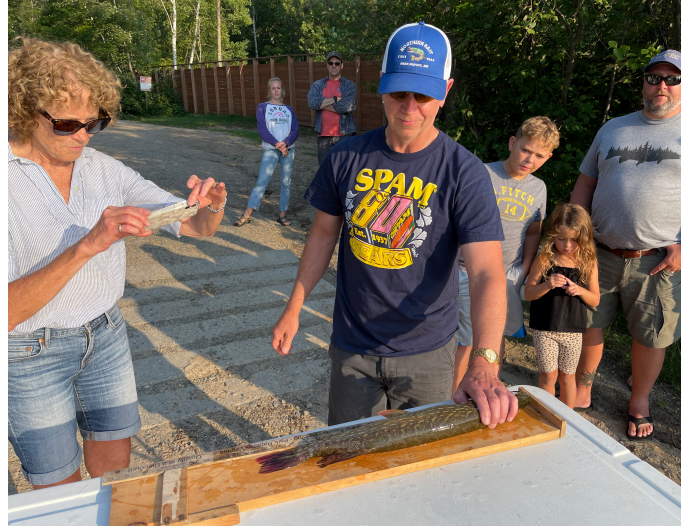
LEFT: FISHERPEOPLE, THEIR FAMILIES AND FRIENDS, AS WELL AS INTERESTED ONLOOKERS, MAKE UP A BIG CROWD. RIGHT: MEASURING AND PHOTOGRAPHING A WINNING FISH.