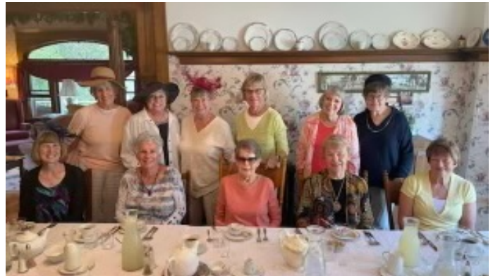
LADIES' VICTORIAN BRUNCH AT THE PARK STREET INN, 2022