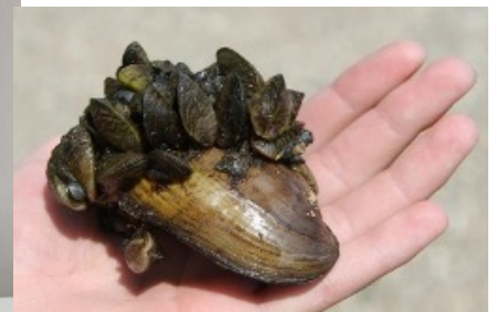
ABOVE: ZEBRA MUSSELS LEFT: ZM SETTLEMENT SAMPLER