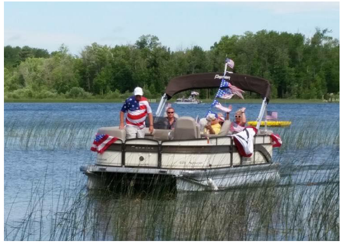
THE FOURTH OF JULY BOAT PARADE