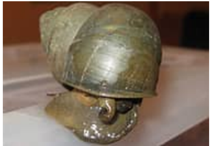
CHINESE MYSTERY SNAIL

The following videos provide information about keeping our boats free of AIS:: (20) Eurasian Watermilfoil: Chokes Lakes - YouTube, (20) Zebra Mussels: Shells Cut Feet - YouTube